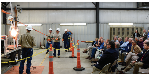
Wheatland linemen and co-op staff give a safety demonstration to legislators and others in attendance during the Co-ops Vote event.

million members across the nation, electric co-ops are a powerful voice on national issues that have a local impact. We want to be sure that our voice is always heard, especially on Election Day.